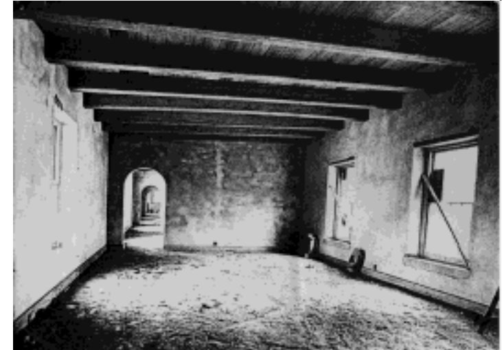
Married quarters in the lodge from the 1966 restoration of the Supreme Court

All half-breed females in the lodge were actually encouraged to marry “a man from the Netherlands,” who would be expected to pay back the cost of upkeep and education of the slave women and to free her. 9 The process of settlers formally marrying Company half breeds was common enough for the Company to resolve to exact compensation from the bridegroom, who was, after all, acquiring property from the company. Not all bachelor settlers could afford this expense. Consequently, there are several examples of ante nuptial contracts, whereby the settler or soldier promised that should his slave bride die before him and not have any heirs, he would leave half of the estate of the marriage to the Company as compensation for the education and upbringing of the slave bride. As can be seen from the following extract from just such a contract, the