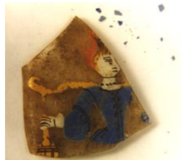
Artifact found in recent excavations in the Lodge by archeologist Dr Gabieba Abraham-Willis showing a European woman carrying a yoke, the symbol of work. Perhaps this was an exemplary icon exhorting the slave lodge women that they had to work. This has become known as the “Painted lady.”

Emerging racial descent criteria came to override long-established patterns of European gender deference in the lodge. No European women worked at heavy manual labor, while all lodge women were used in the heaviest work, including mining. Further, it was more important in the lodge to be mestiço than female, at least as far as the allocation of easier tasks and the granting of freedom were concerned. But lodge women used the system to acquire the best life chances for their offspring and then themselves.