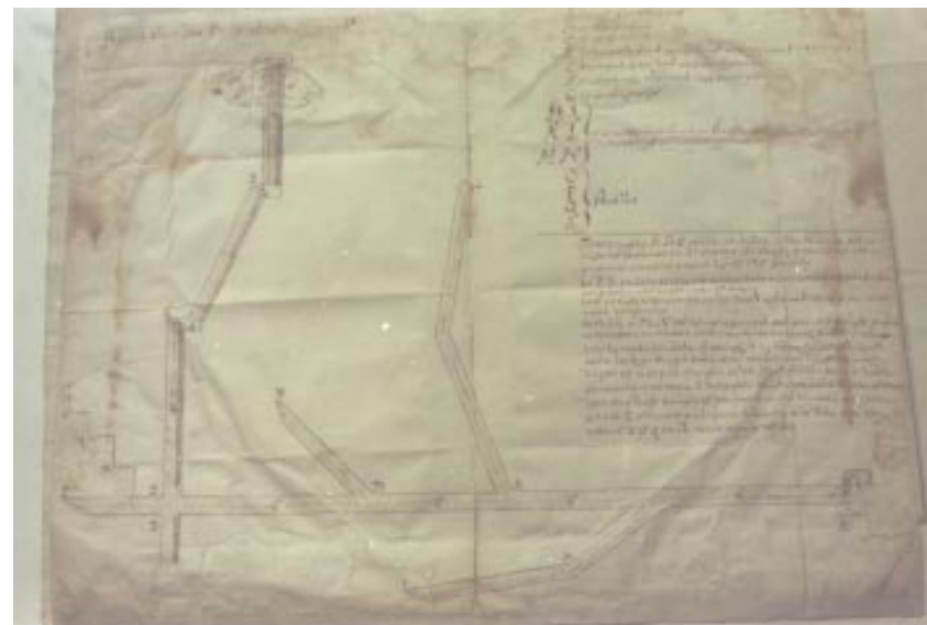
Diagram of Silvermine. RA Kaartenafdeeling

The most important aspect of female slave labor in the lodge was that apart from childbearing, the Company made little distinction in the type of labor which men and women could do. The Company throughout this period had no hesitation in assigning slave women to the most gruelling tasks. For example, at the Company mine at Silvermine (on the road to present-day Kommetje), a mine which was worked around the clock, 35 a small undivided hut was set aside for the men and women slaves. 36 It should be remembered that woman in contemporary England had proved efficient miners as they could crawl through the narrow coal tunnels dragging carts with ropes between their legs without encumbrance. The legend in the illustration of this Cape mine shows that the Dutch made a distinction between the maximum number of Europeans (50) and slaves (150) who could safely be in the mine at one time, but no mention was made of women, a further hint that no gender deference was shown to Company slave women with regard to heavy manual labor. 37